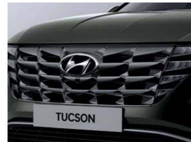
Silver paint radiator grille