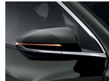
Outside mirror LED repeaters (Optional)