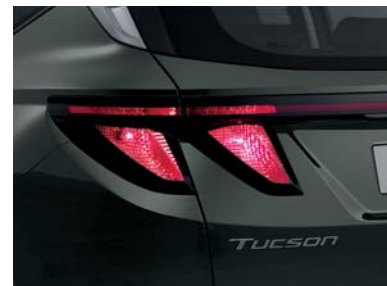
Rear combination lamps (Standard)