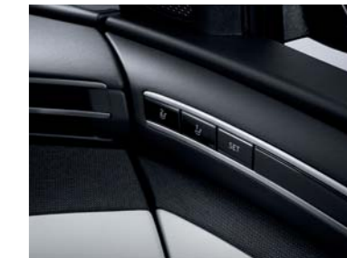
Integrated memory system (IMS)