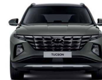
Overall Width 1,865 Wheel Tread* 1,615