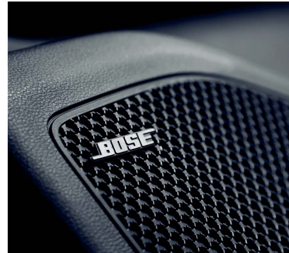
Bose premium audio