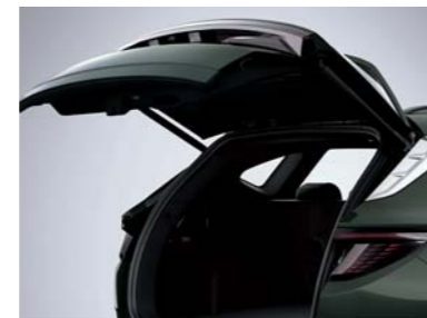
Smart tailgate system