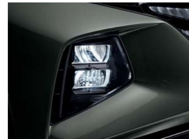
MFR LED headlamps (Optional)