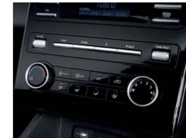
Manual air conditioning system