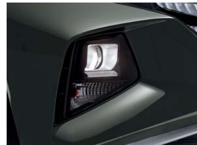
Projection headlamps (Standard)