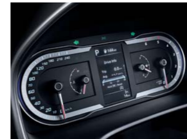
4.2" TFT LCD Supervision cluster