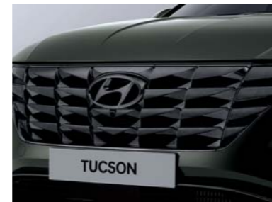
Dark black chrome radiator grille