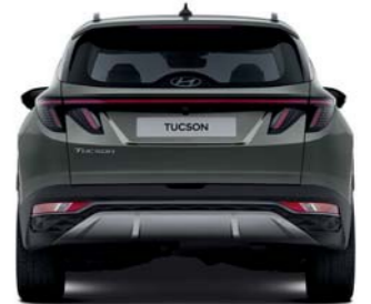
Wheel Tread* 1,622

Unit : mm * Wheel tread • 17" Wheel (Front/Rear) : 1,620/1,627 • 18" Wheel (Front/Rear) : 1,615/1,622 • 19" Wheel (Front/Rear) : 1,615/1,622