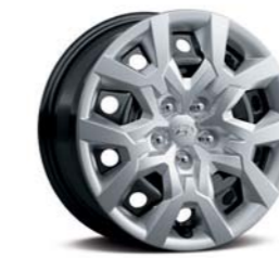
17" Steel Wheels