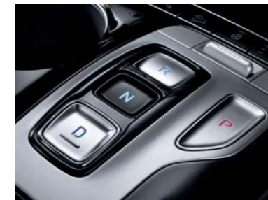
Shift-by-wire automatic transmission (Optional)