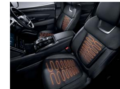
Heated front seats