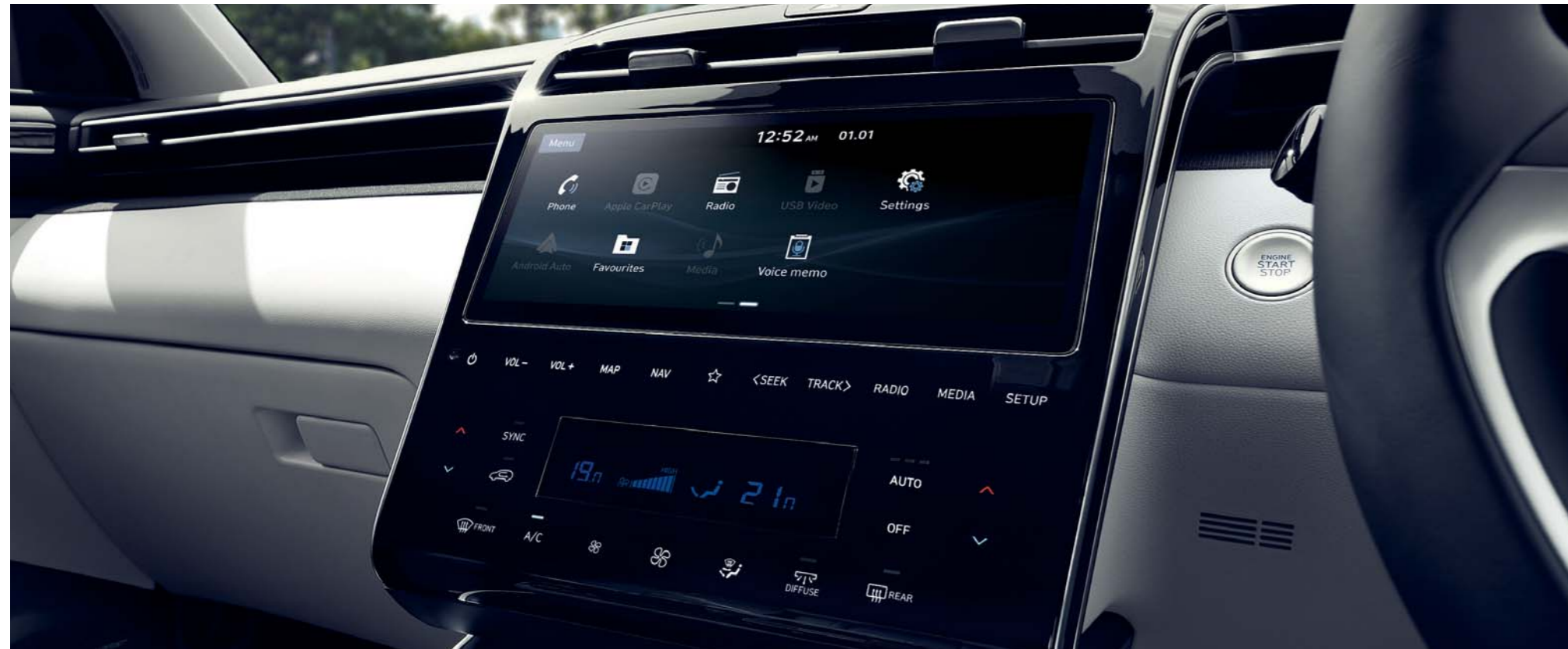
10.25" LCD touchscreen