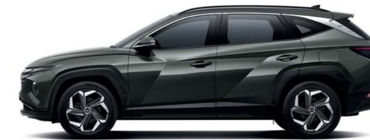
Overall Length 4,630 Wheel Base 2,755