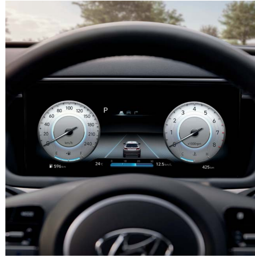
10.25" open cluster