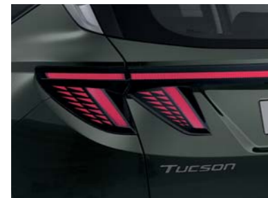
LED rear combination lamps (Optional)