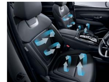
Ventilated front seats