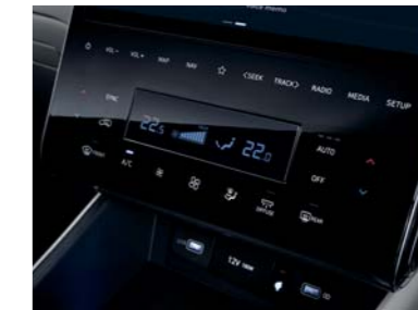
Full auto air conditioning system