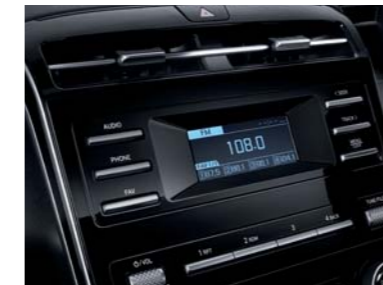
3.8" Standard audio system