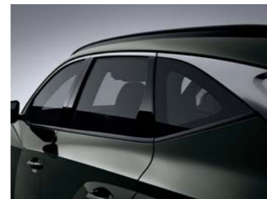
Chrome-coated DLO molding