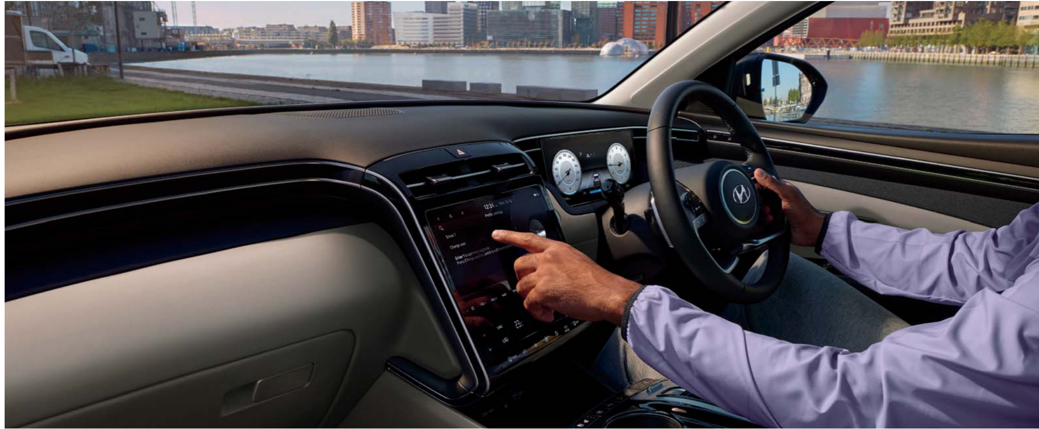
Full-touch center fascia (Personalized profiles)